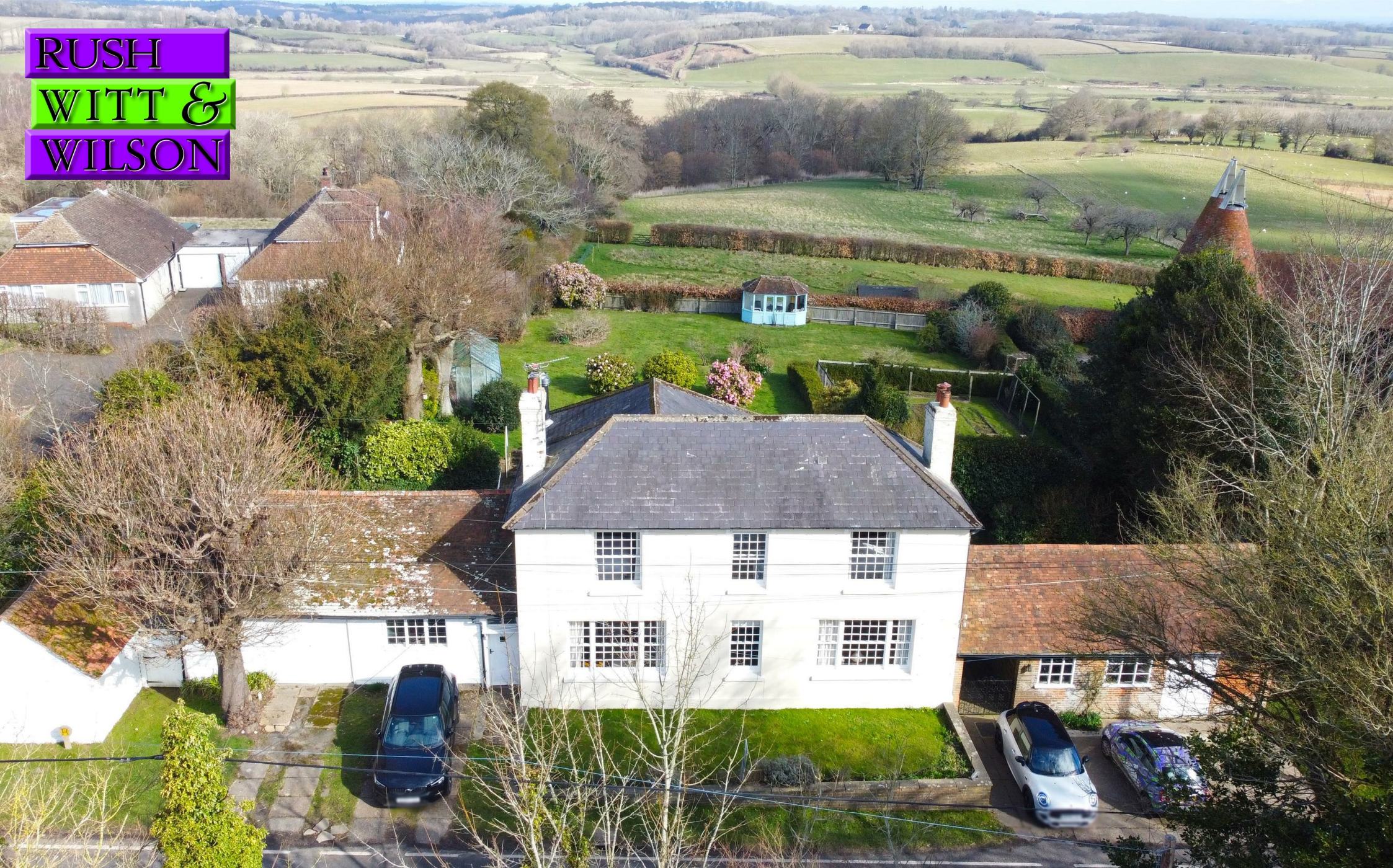
Forge House Udimore Road, Udimore,, East Sussex TN31 6AY Guide Price £750,000